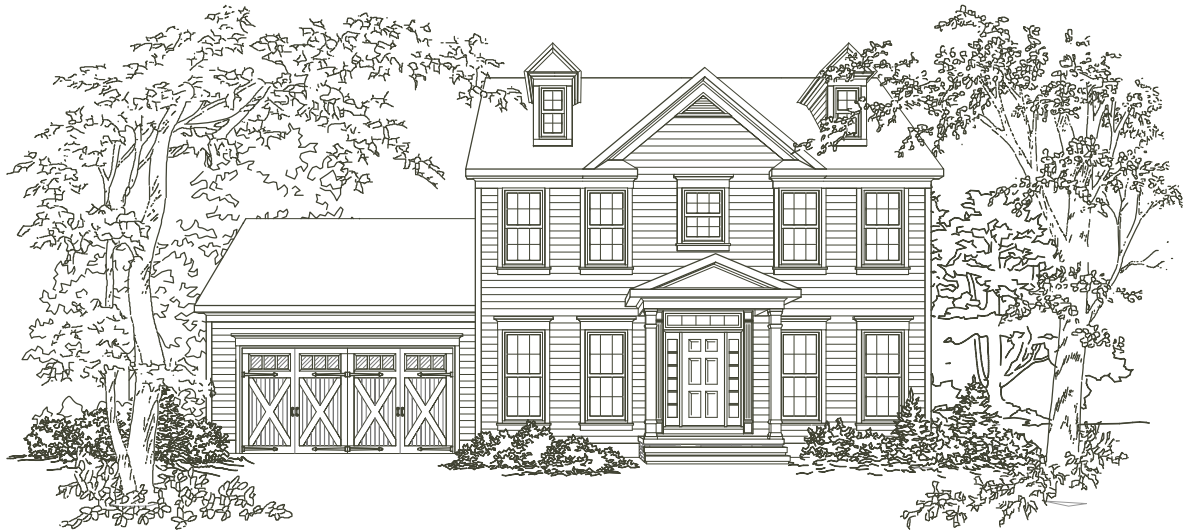
FRONT ELEVATION #3