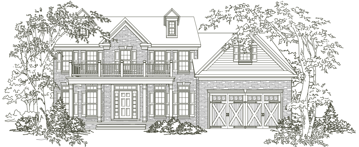
FRONT ELEVATION #8