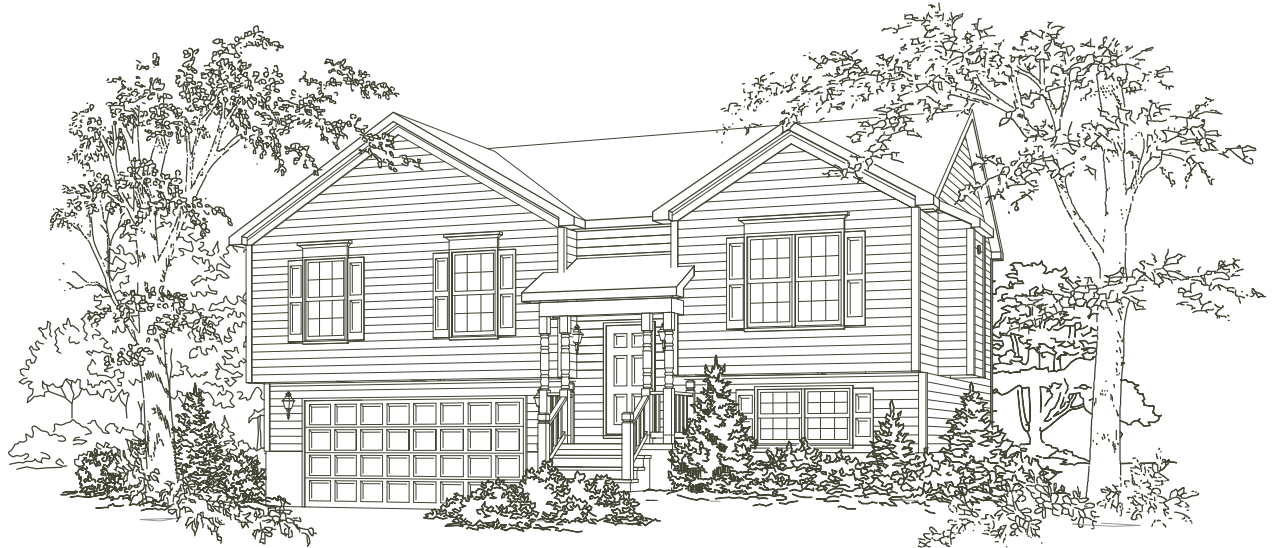
PLANSHOP.BIZ PLAN # O3CLA-A1130