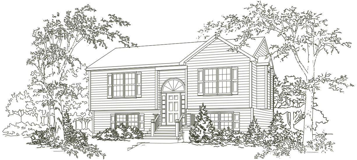
PLANSHP.BIZ PLAN # 03STO-A855