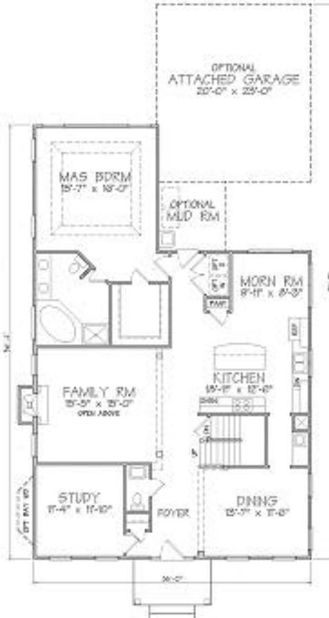
LOWER LEVEL 1106 SQ FT

LOWER LEVEL WITH OPT MLD ROOM - 1181 SQ FT