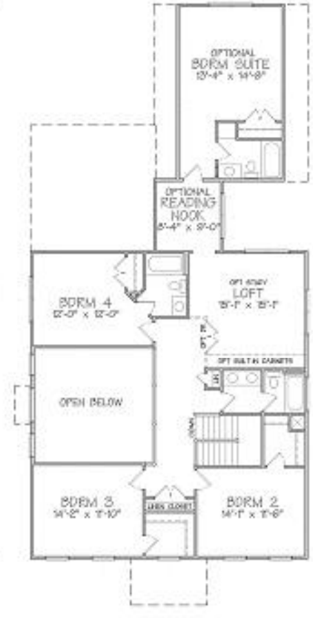
UPPER LEVEL 1201 SQ FT