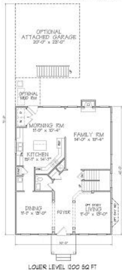
LOWER LEVEL 1200 SQ FT

LOWER LEVEL WITH OPT MUD RM - 1211 SQ FT