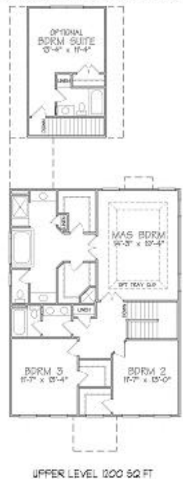
UPPER LEVEL 1200 SQ FT