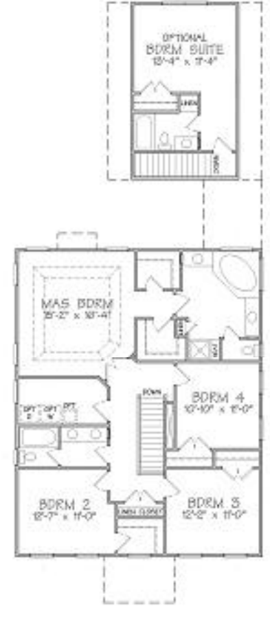
UPPER LEVEL 1280 SQ FT