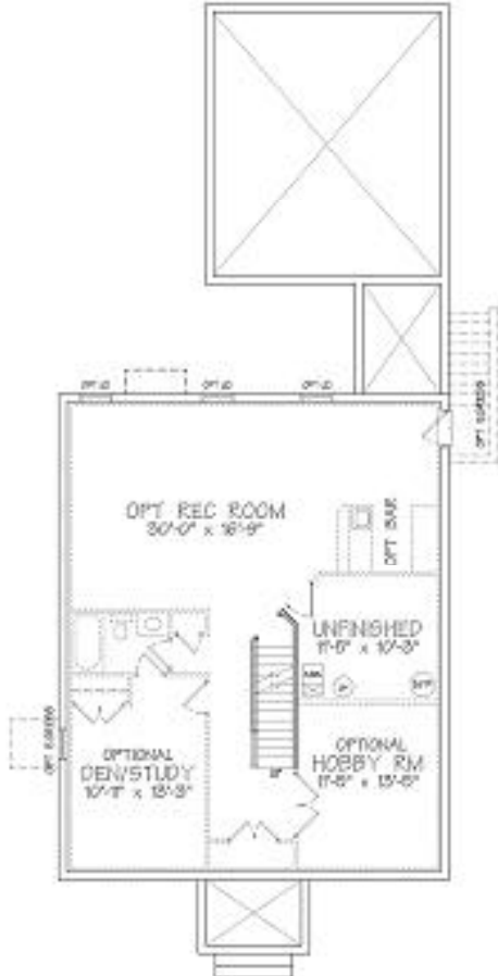
BASEMENT PLAN 1280 SQ FT